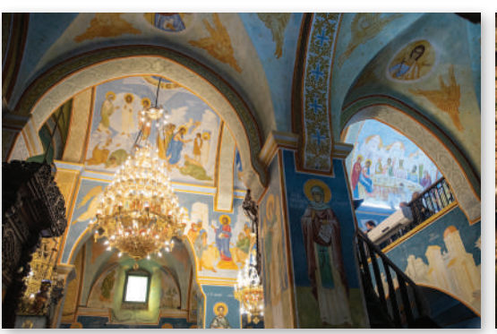
Follow Us On: