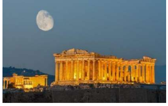
Note: While we do our very best at making sure all items listed in your itinerary are included, there are times when conditions beyond our control affect your program/itinerary, including but not limited to air carrier changes, delays, weather, political climate, time constraints, or changes by your tour leader and tour guide.