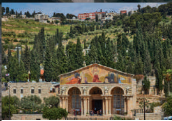
Garden of Gethsemane