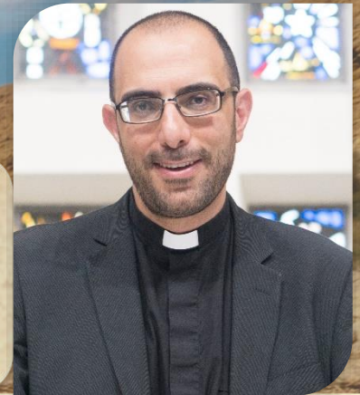
Bishop Paul Egensteiner

February 03 - 13, 2025 From New York, NY (JFK) Package Price: $4190