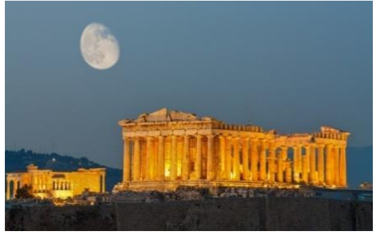
Note: While we do our very best at making sure all items listed in your itinerary are included, there are times when conditions beyond our control affect your program/itinerary, including but not limited to air carrier changes, delays, weather, political climate, time constraints, or changes by your tour leader and tour guide.