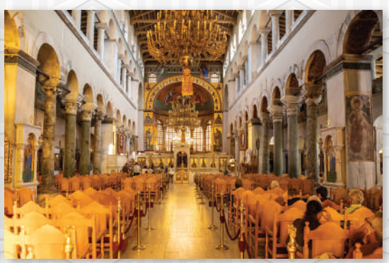
Follow Us On: