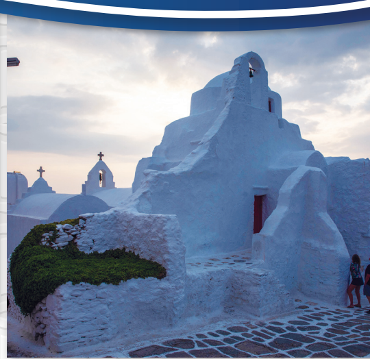
PACKAGE INCLUDES: Roundtrip Airfare | All nights accommodations in double occupancy luxury hotels Breakfast, lunch, and dinner daily | Sightseeing in modern, air-conditioned private bus English-speaking government licensed tour guide | 4-night Cruise | 2 Shore Excursions | And Much More