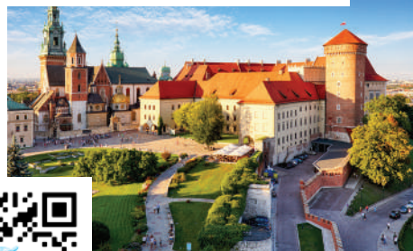
Wawel castle, Krakow