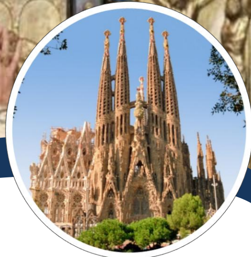
Sagrada Familia Spain