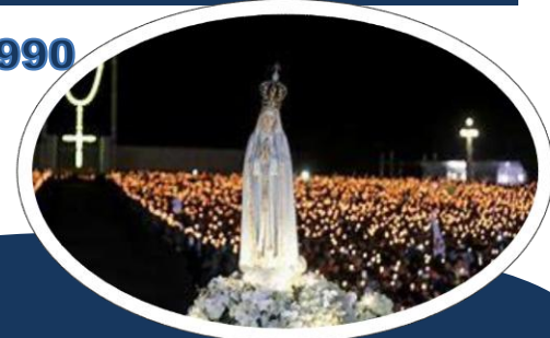
Our Lady of Fatima Portugal