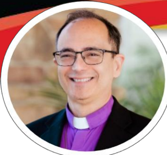
Bishop Chris deForest

EXTENSION OPTIONAL POST-TOUR AVAILABLE: Dates: OCT. 18 - 21, 2026 Package: TBDE | Single Supplement: $390