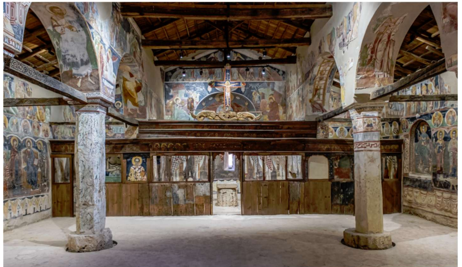
Church of St. Demetrius near Aigai (Vergina)

Acts 17.14 reports that when Paul was chased out of Beroea, friends escorted him to the coast and then on to Athens. Almost certainly this means that Paul headed east from Beroea and passed through Aigai (a UNESCO heritage site; modern Vergina) to get to Methoni or Pydna on the Aegean Sea. Aigai is famous as the site of one of the palaces of Philipp II (father of Alexander the Great) and the theater where he was assassinated and Alexander assumed power. At Aigai we will visit the Polycentric Museum with its incredible archaeological displays, then to the 'immersive' experience of the Museum of the Royal Tombs, and then on to the theater and Palace. From Aigai we will then hike the beautiful countryside with its fields, orchards, and forests along Paul's likely path, including a stop at the Church of St. Demetrius. The bus will pick us up at the Church of St Nicholas in Neokastro and return us to our hotel in Veria for dinner and overnight. (~9 miles)