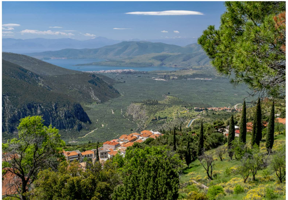
View from Delphi to Kirra and Gulf of Corinth – We walk from here, across the spur extending into the valley and to the Gulf of Corinth in the distance. The valley is a 'sea' of olive trees.

Following lunch, we continue on to Corinth , a place Paul visited three times and spent several years. (Acts 18.1-17) We will start at Corinth's Lechaion Harbor and walk part way, at least passing by the Asklepios and the Spring of Aphrodite, to the main archaeological site. For dinner and overnight, we will be at the Alkyon Resort on the Gulf of Corinth, another fine spa resort hotel with many amenities.