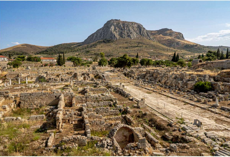
Corinth: Lechaion Road leading to forum and bema; Acrocorinth in distance

At the end of his first time in Corinth, Acts 18.18 reports that Paul went to Corinth's other harbor, Cenchrea , on the Aegean Sea in order to sail back to Jerusalem. We will trace Paul's steps as we walk through the countryside from Corinth to Cenchrea. (~7.5 miles) Passing by Isthmia —one of the four sites of the ancient Panhellenic games with Olympia, Delphi, and Nemea—we return by bus to Corinth for an exploration of the Acrocorinth . (~1.9 miles) The Temple of Aphrodite is at the top of the site, but it is more impressive for the fortifications that date back to the classical period. We return to the Alkyon Resort for dinner and overnight.