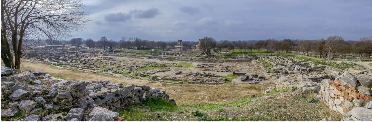
Philippi: View of Roman forum and bema (center) and Roman basilica (right) with Christian Basilica B in the distance

time to tour this amazing site (including the traditional prison of Paul and Silas) before we continue on to the Lydia Baptistry site. (Acts 16.11-40) Here we will have the opportunity to reaffirm our own baptisms. (~12 miles) The bus will pick us up and bring us back to the hotel in Kavala for dinner and overnight.