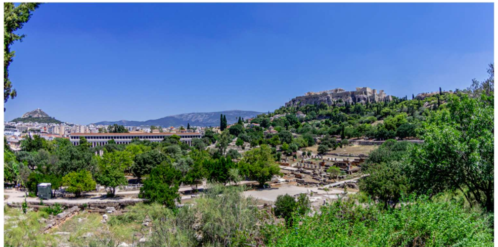
Agora in foreground with Acropolis and Areopagus at distant right

You will have a free day in Athens! There is so much to see and do, and it's all up to you. If you're the museum sort, Hoffman recommends the National Archaeological Museum, the Byzantine and Christian Museum, or the Acropolis Museum. (Entrance fees not included in tour price.) If you're up for more hiking, consider going up the Philopappos Hill with excellent views and a stop at the Pnyx where the ancient Athenian ekklesia met to deliberate. Or maybe you just want to wander and get lost for a bit browsing, shopping, and eating in Plaka and Monastiraki. Or maybe go watch the impressive changing of the guard at the Monument to the Unknown Soldier near Syntagma Square. Or there is the Olympic Stadium or ... The only problem will be choosing what you most want to do! Return to the Stanley Hotel for overnight.