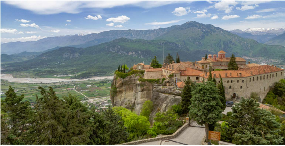
St. Stephanos Monastery at Meteora

The bus will pick us up and drive us to a brief stop at Thermopylae , site of the battle between the Spartans and Persians in 480BCE. From there we continue on to Delphi , the most famous oracle site in the ancient world. After touring the museum and the archaeological site (~2.5 miles), we will go down to the Europa Beach hotel on the Gulf of Corinth for dinner and overnight.